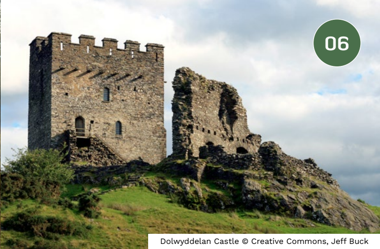
Dolwyddelan Castle

Map Ref: SH 79124 56782 Latitude: 53.094379 Longitude: -3.8063231